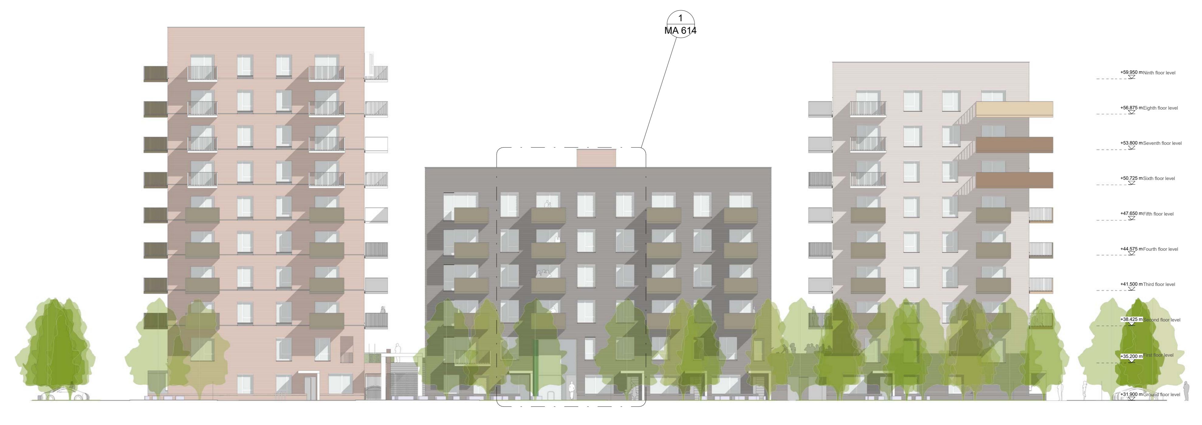
SANDOW SQUARE - SOUTH ELEVATION - B 1:200