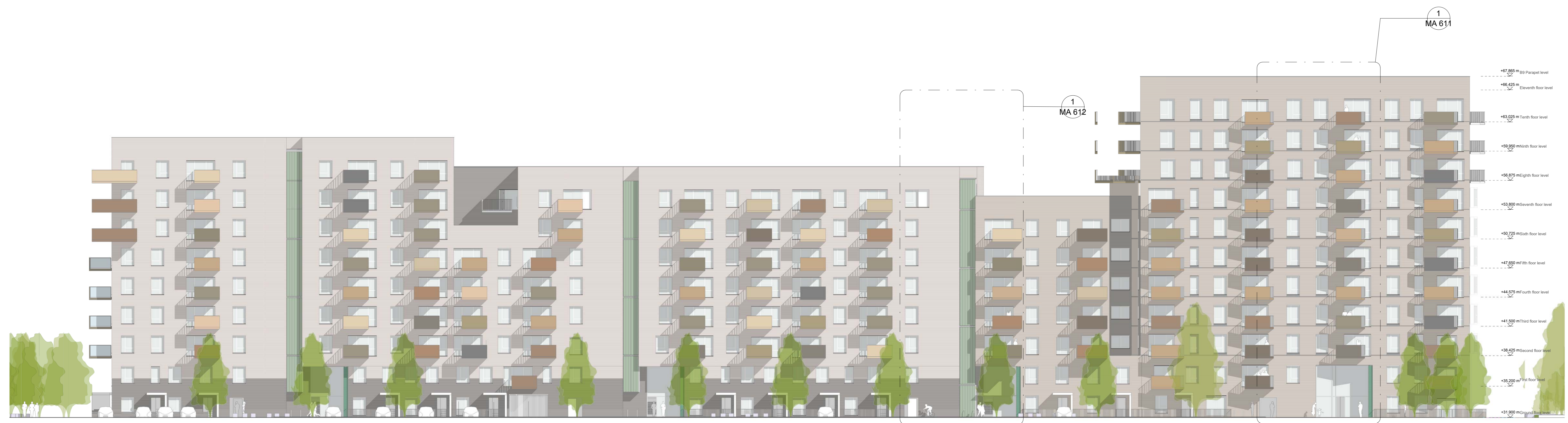
CANAL STREET ELEVATION - BLOCK B 1:200