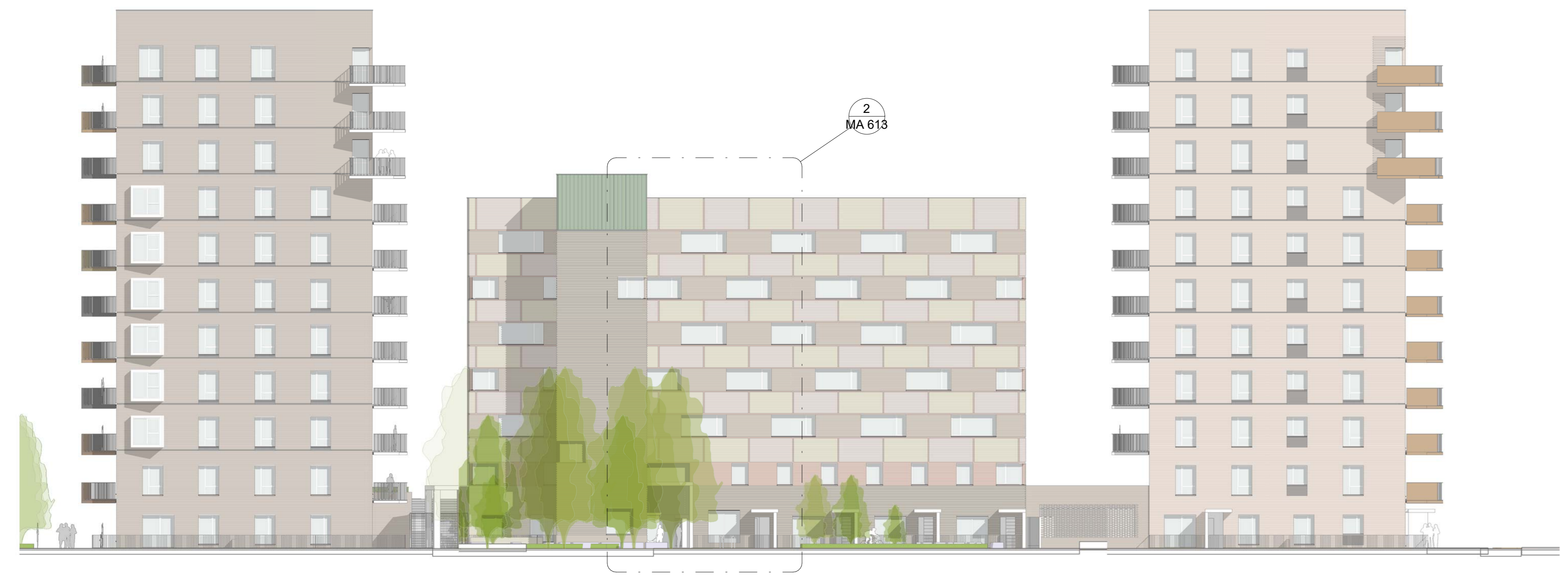
NORTH ELEVATION - B9 1:200