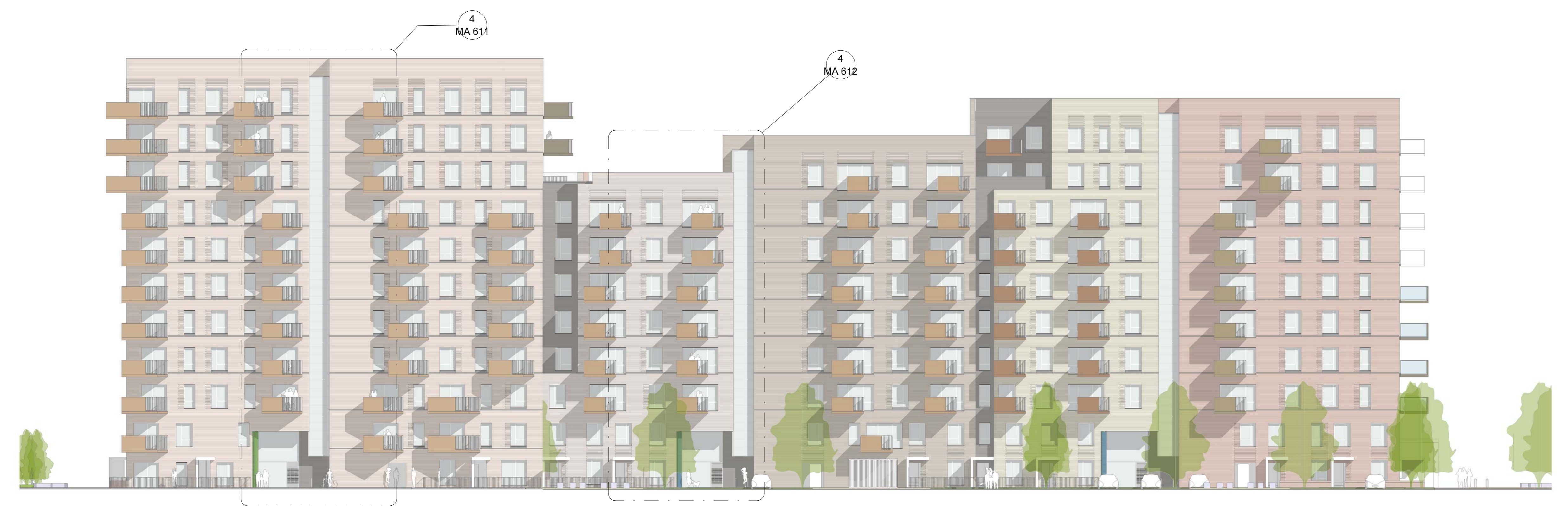
MILK STREET - WEST ELEVATION - BLOCK B 1:200