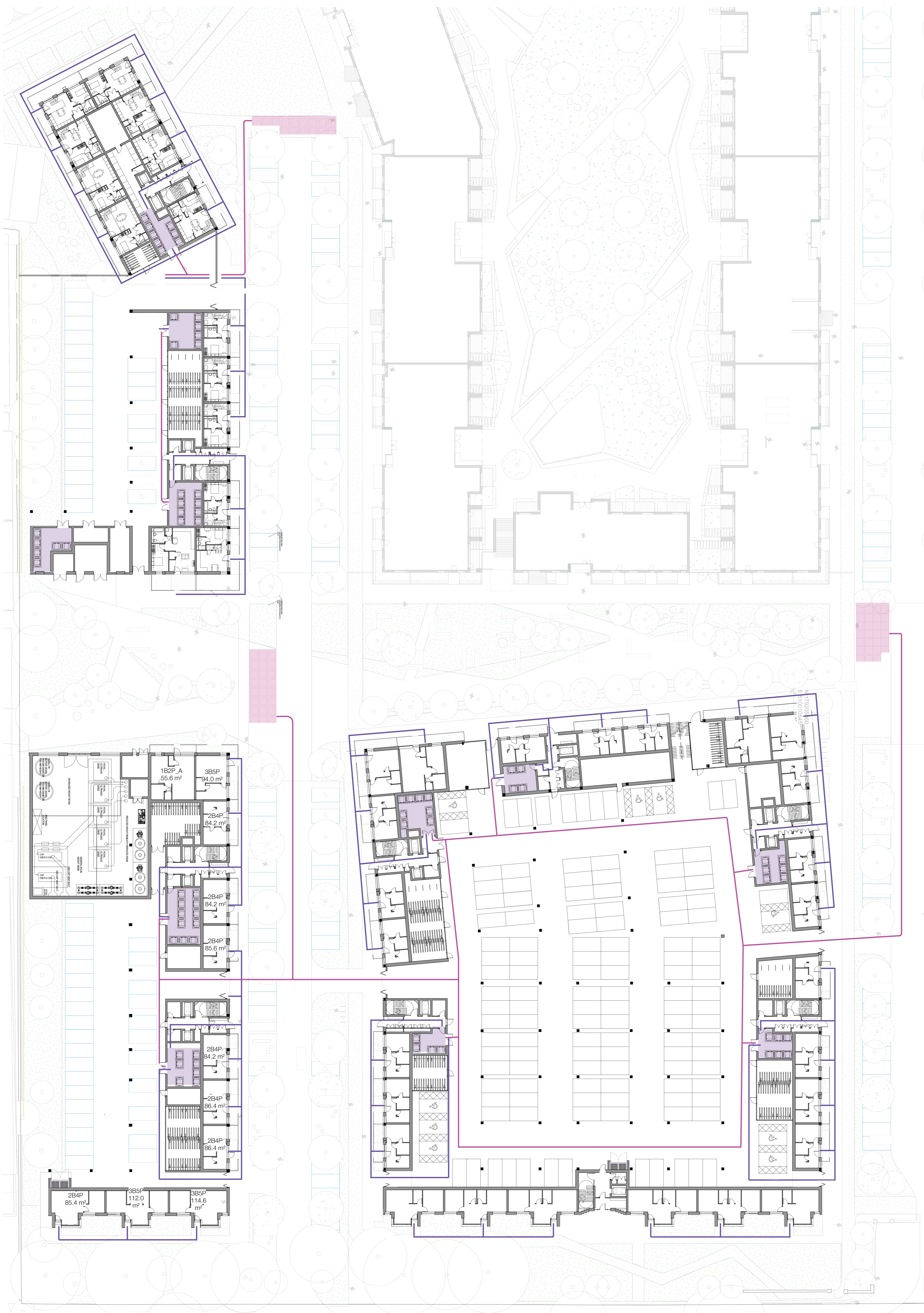
Servicing strategy 1 : 300