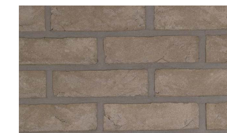
C6 Main Facade Grey Stock Brick