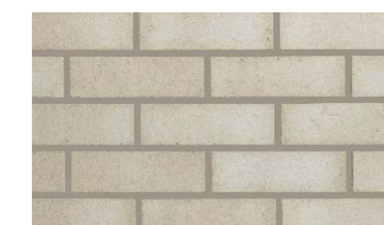
C6 Plinth White Brick