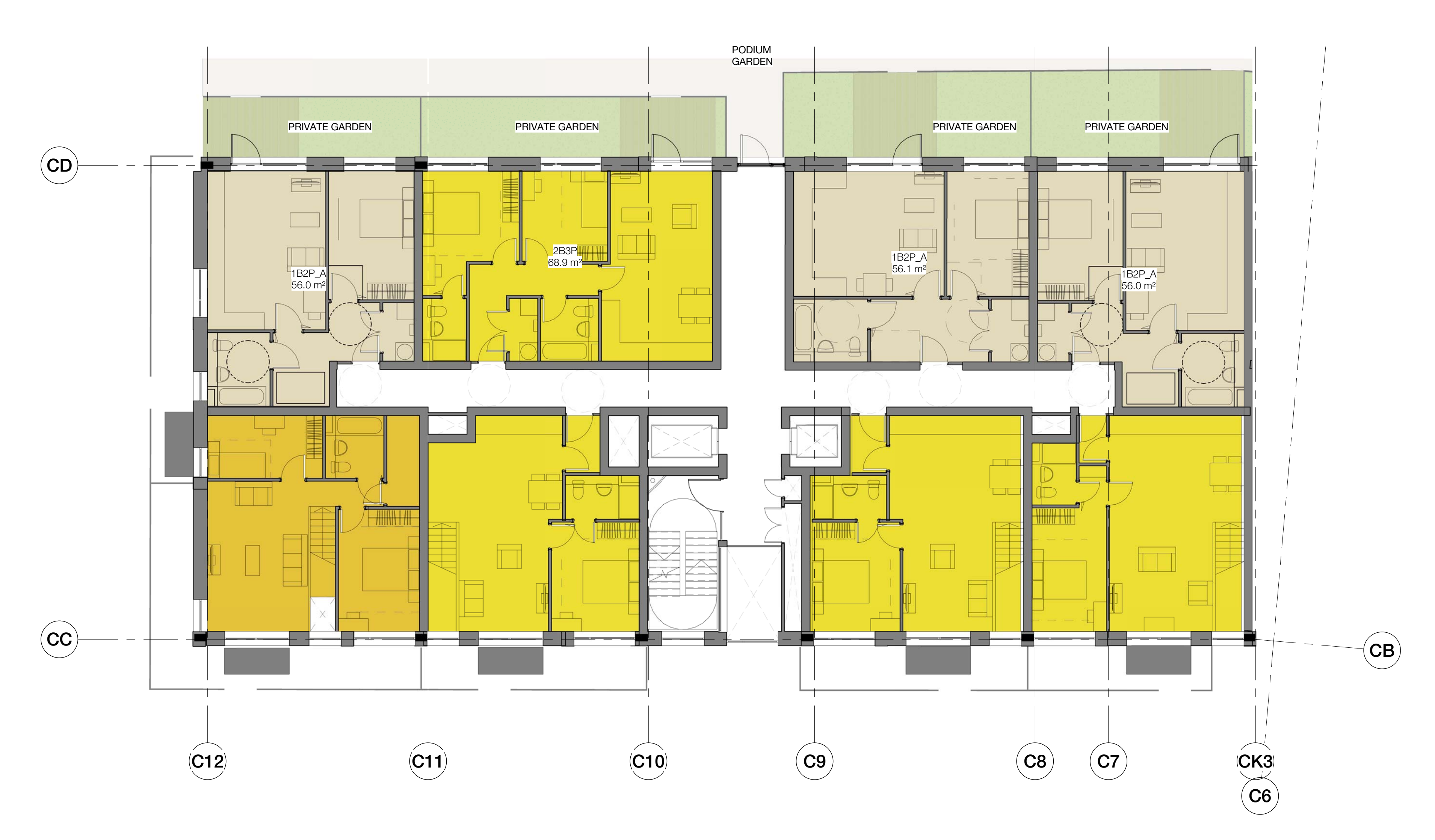
Block C2 - 1st Floor 1:100