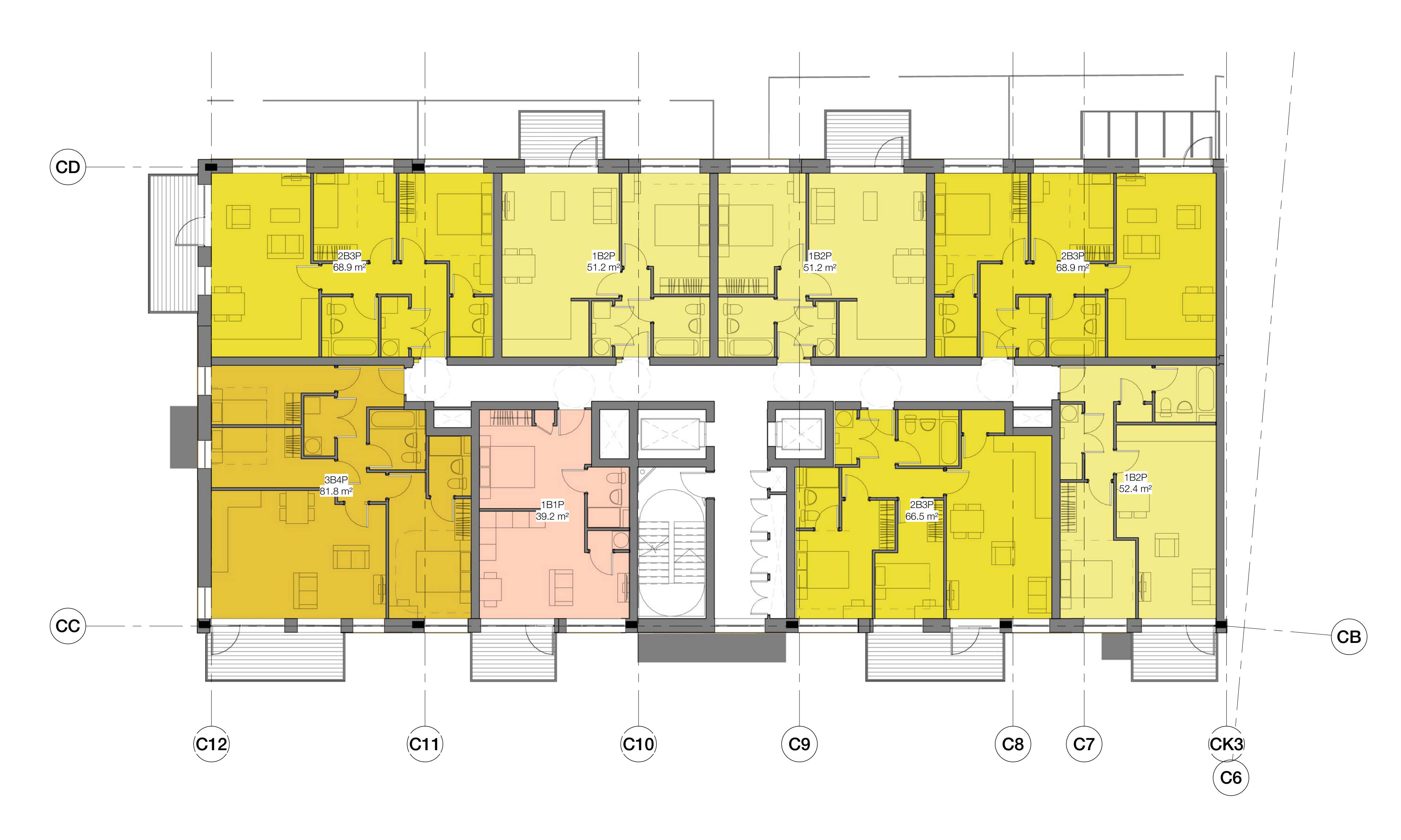
Block C2 - 2nd to 7th Floor 1:100