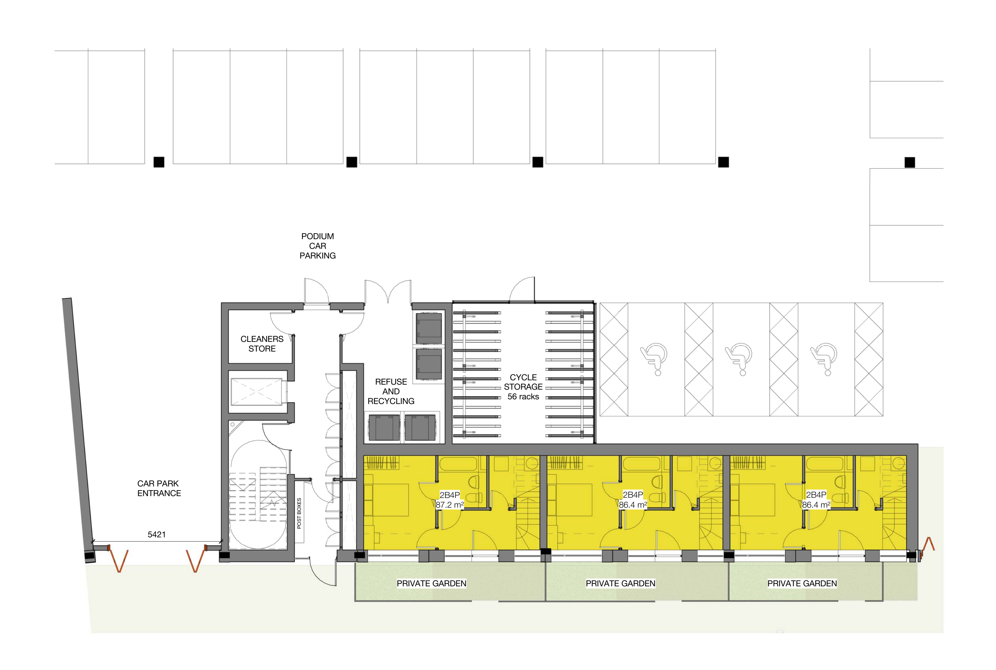
Block C1 - Ground Floor