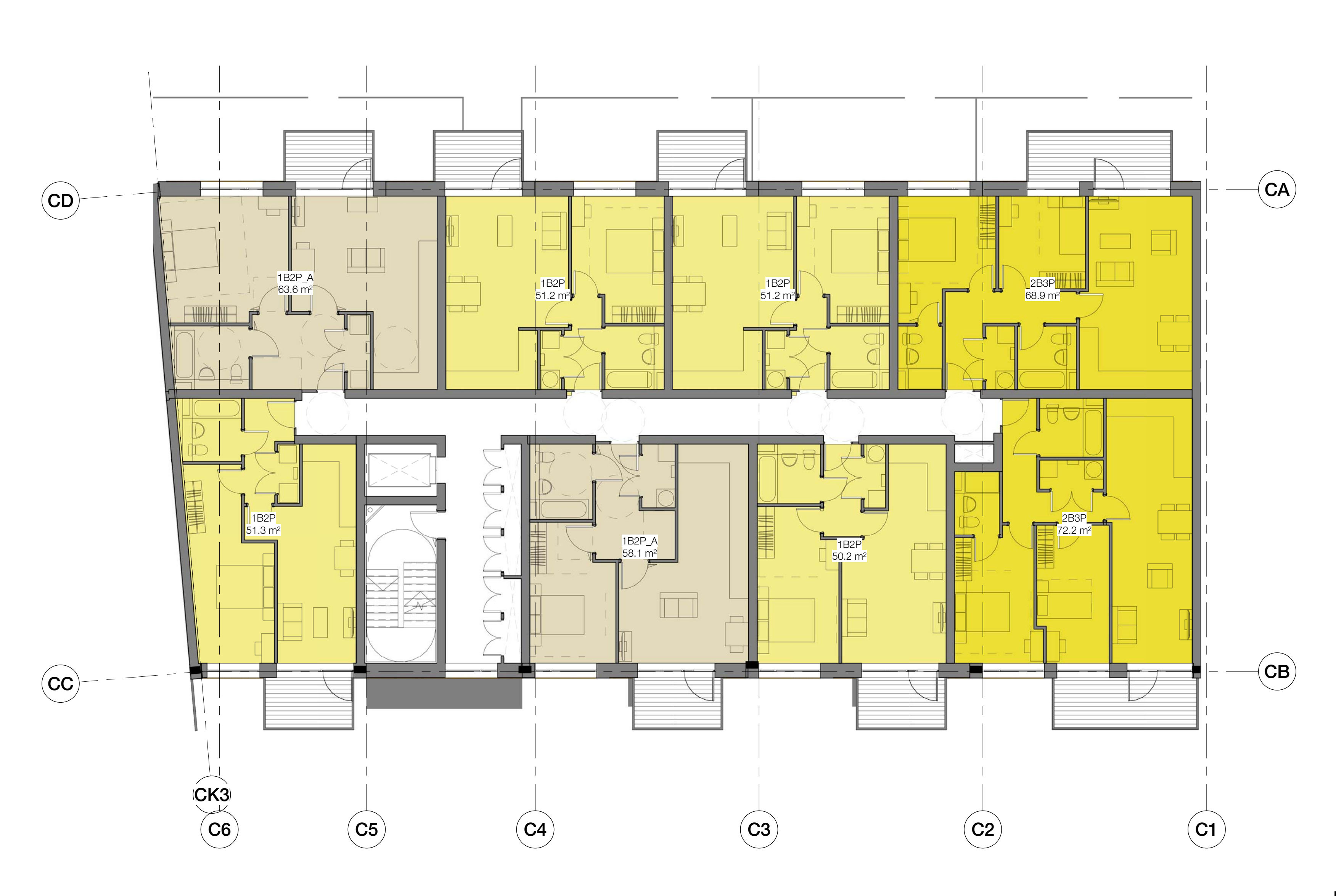
Block C1 - 2nd to 3rd Floor 1:100