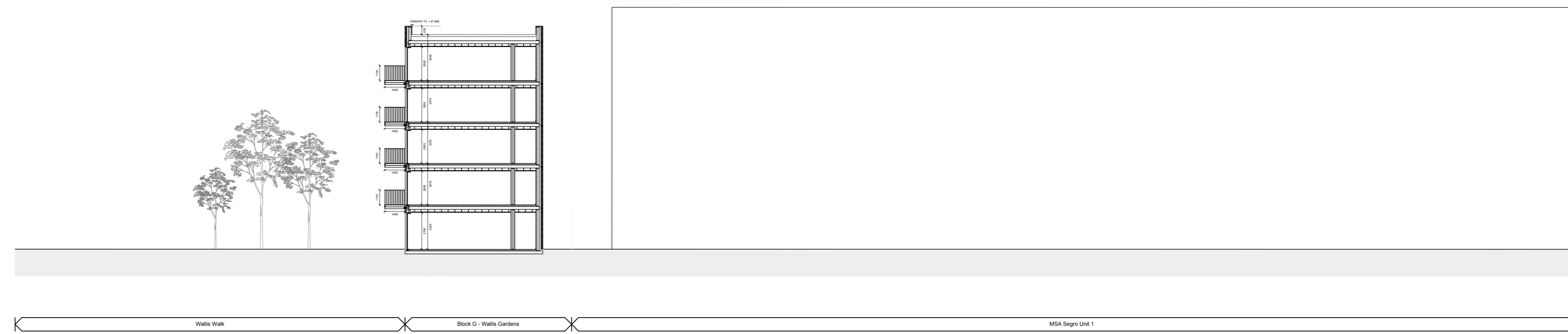
Section EE Block G