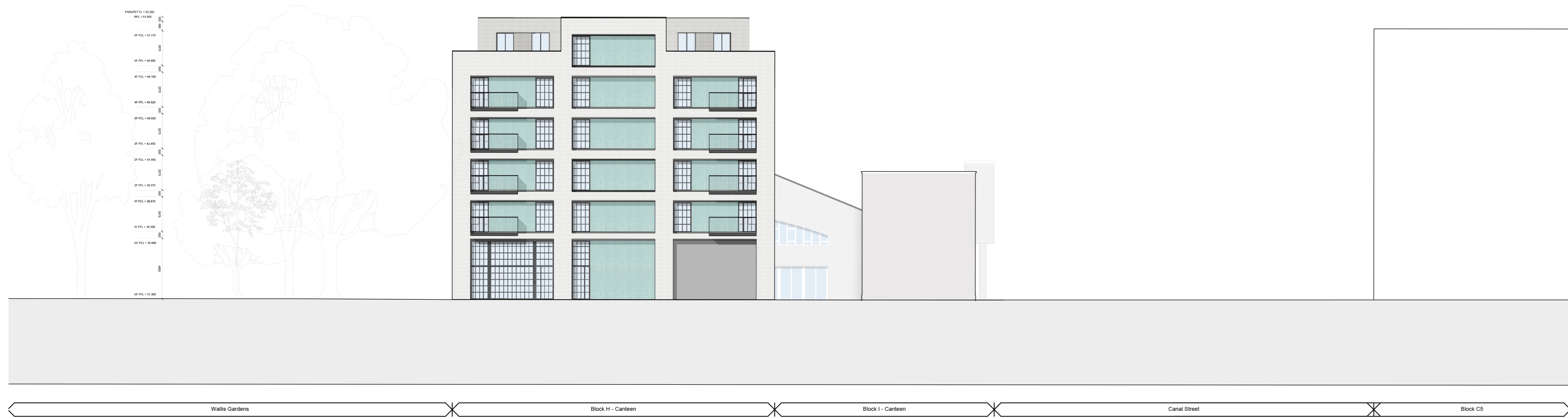
Block H & I North Elevation