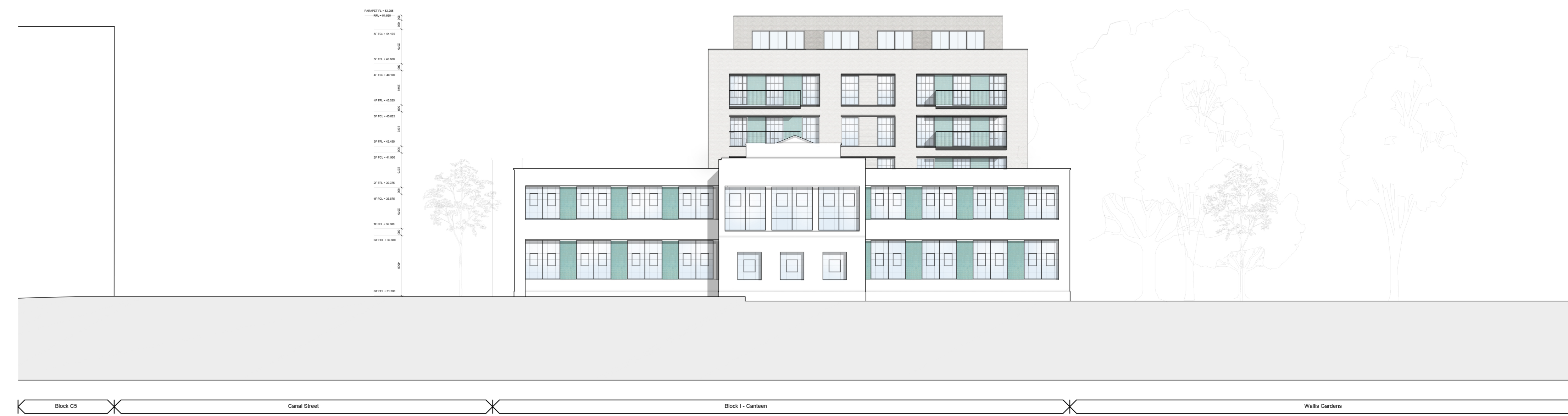
Block H & I South Elevation