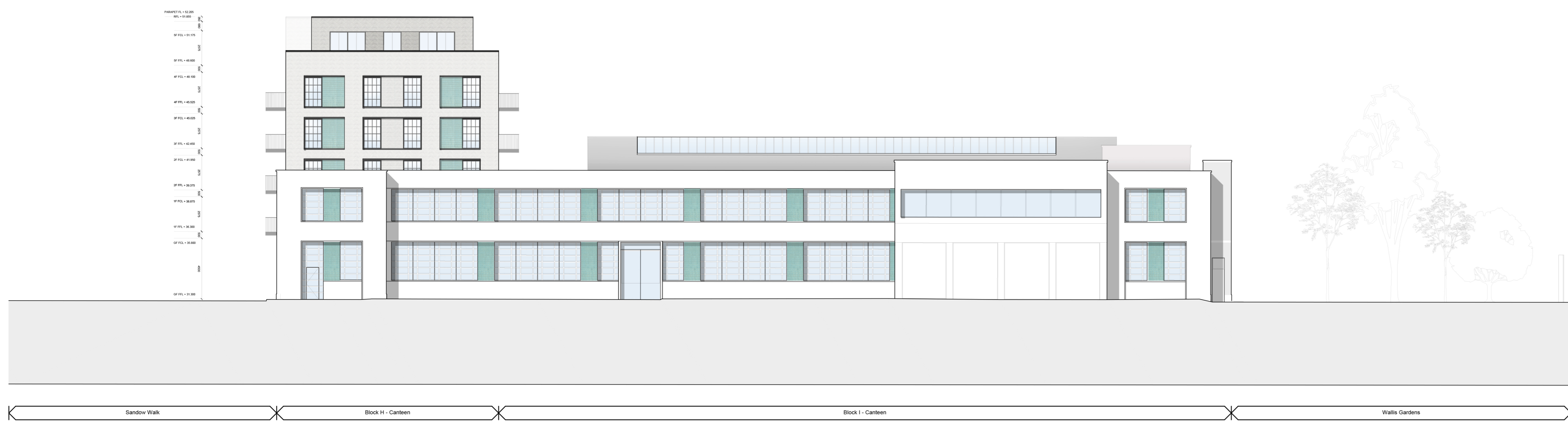
Block H & I West Elevation