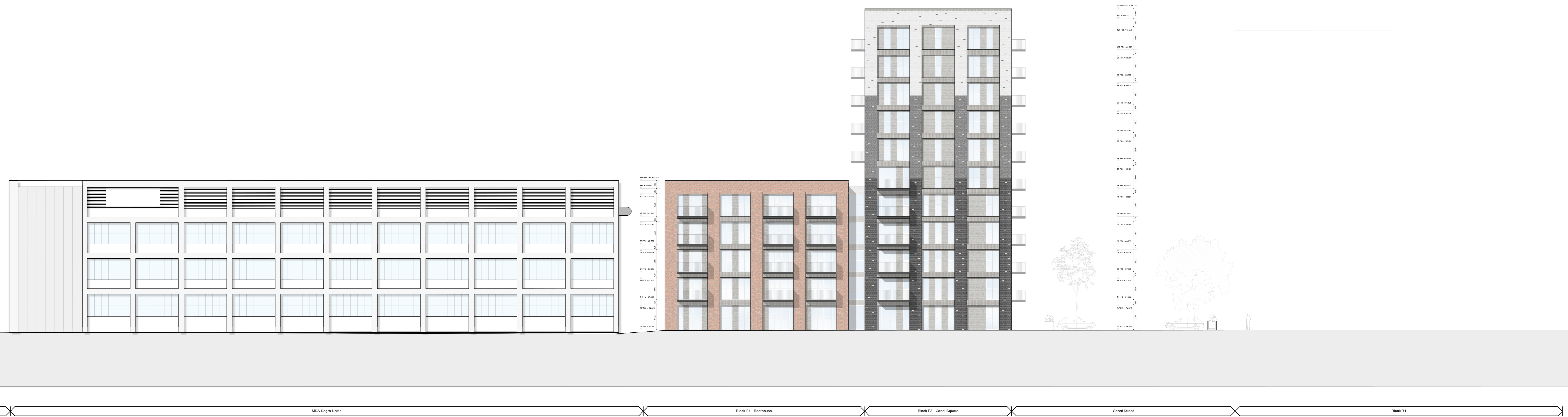
Block F3 & F4 North Elevation