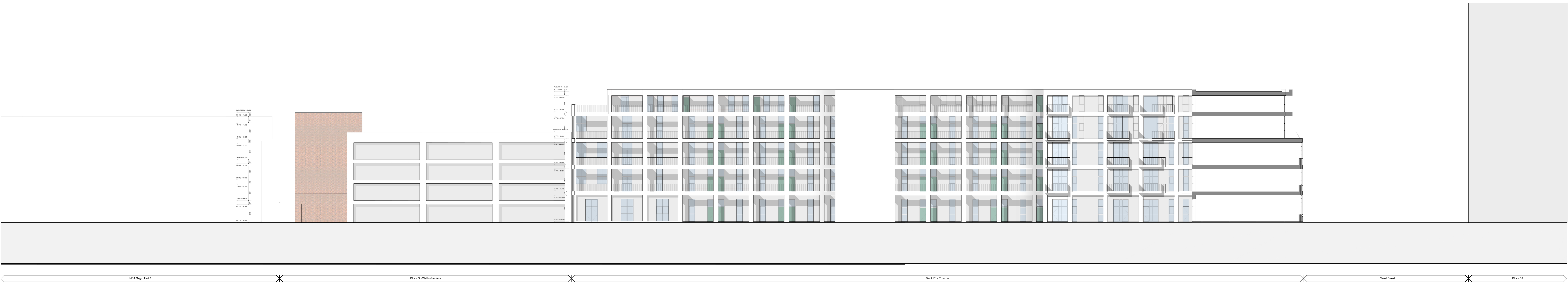
Block F1 & G North Elevation