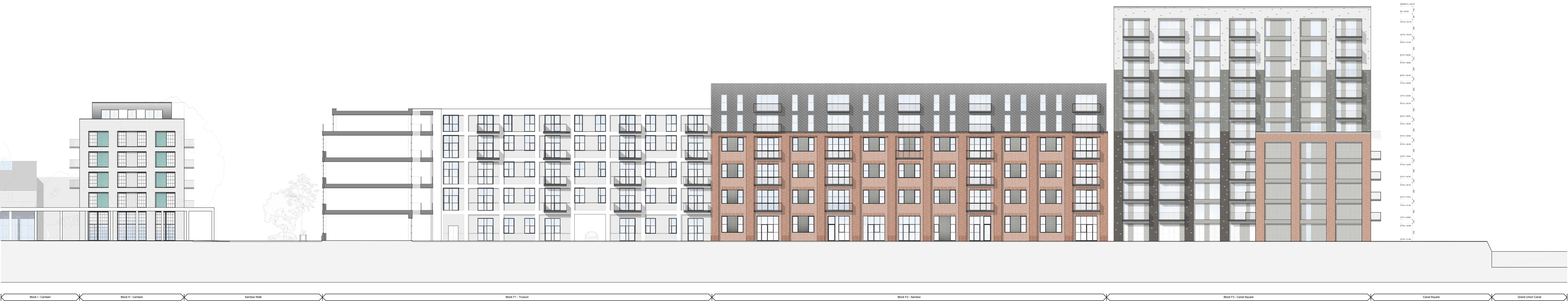
Block F1, F2, F3 & F4 East Elevation